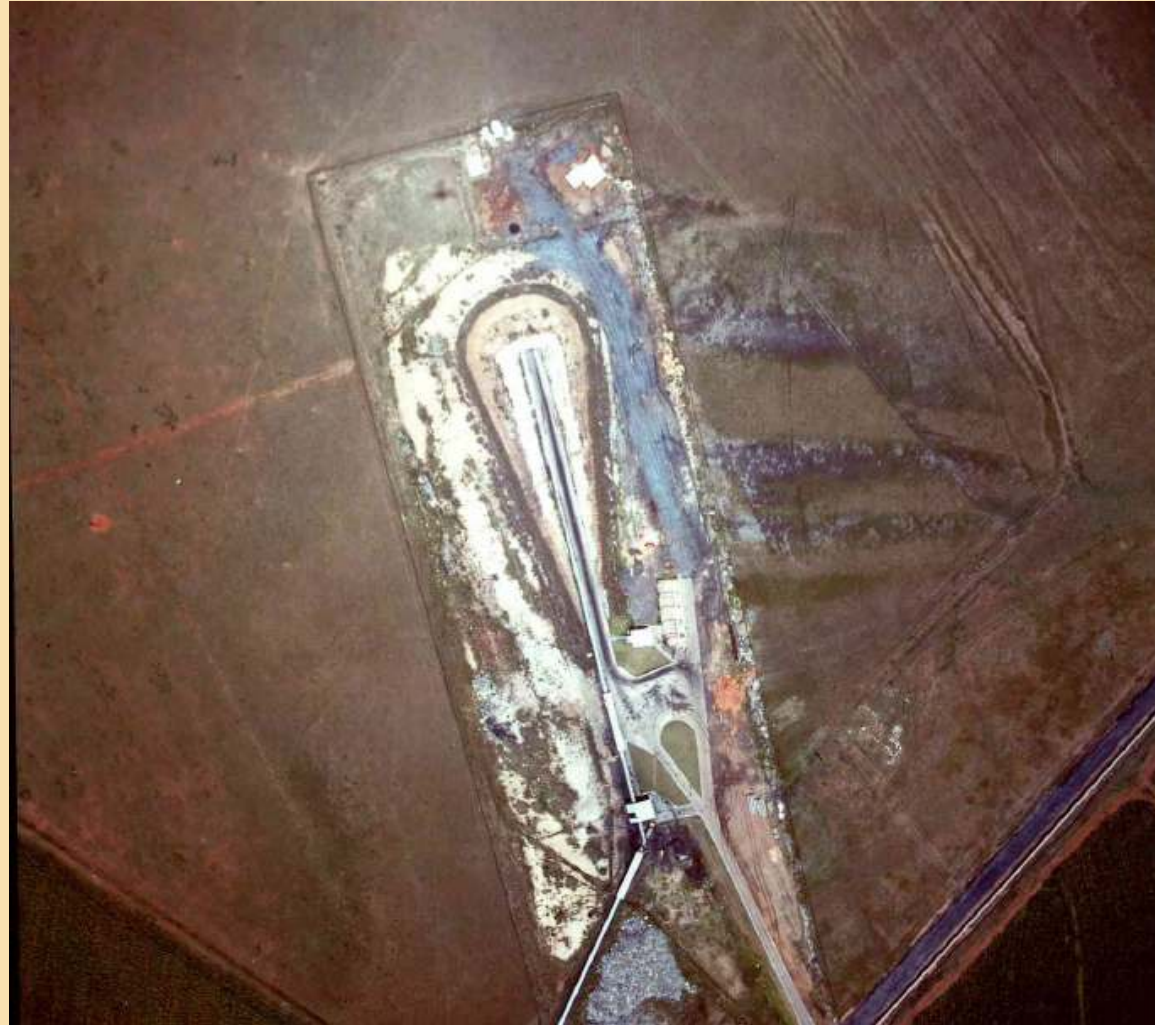
Pollution caused by materials handling